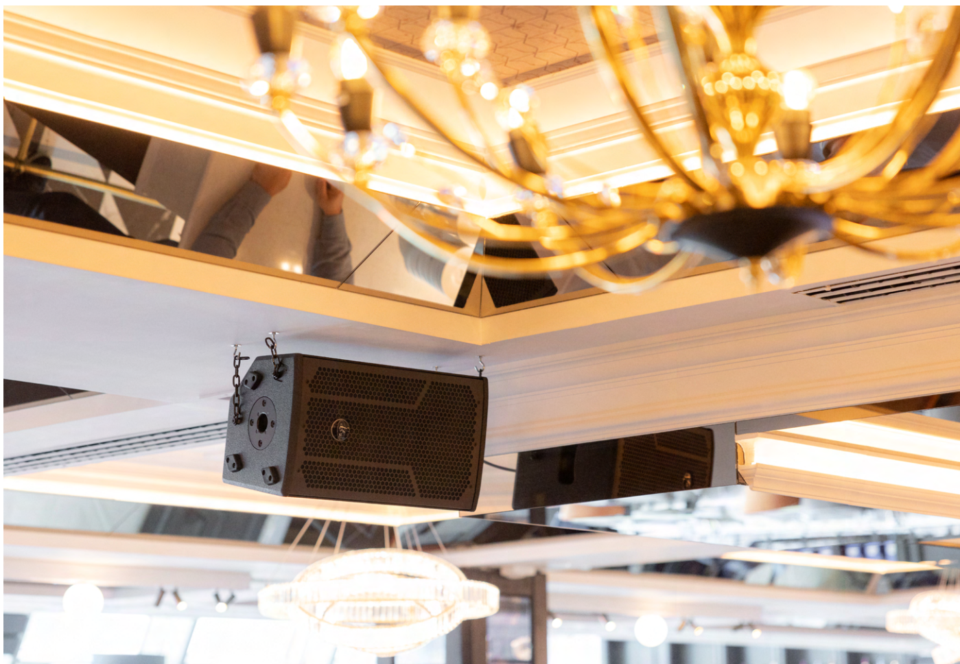
Dolly Bell Restaurant, Belgrade